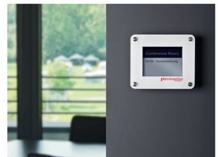
Meeting room system