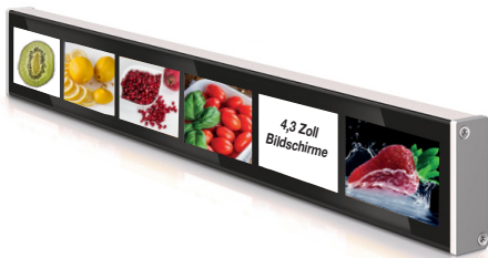
Shelf product advertising