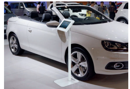
Shelf bracket and floorstand