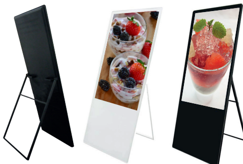
Digital customer stopper