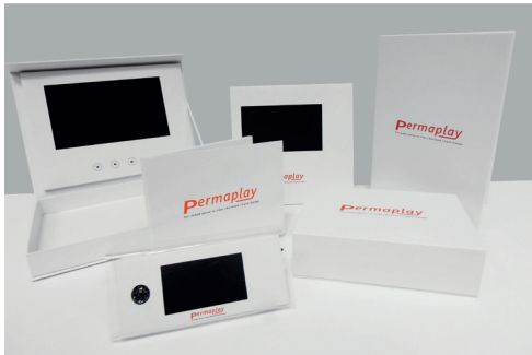
Video box & video brochure

Permaplay Media Solutions GmbH is one of the leading companies for the development, production and distribution of media for use at the POS. The internationally experienced company is a strong advocate of synergetic action and the sales-promoting coordination of various advertising platforms.