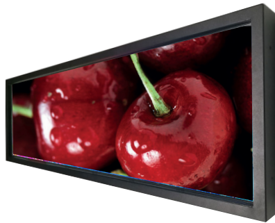
Ultra wide LCD screens